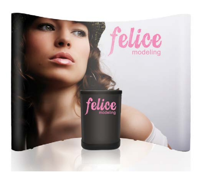
*Podium graphic is optional.